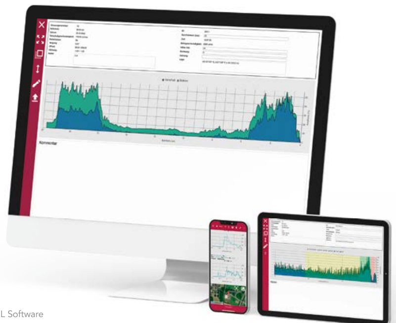
Measurement graphs shown in the IML Software

In addition to the visual inspection, the IML-RESI PowerDrill® provides non-subjective results. Our office offers training and customer support preparing the operator for safe, effective, and proper handling of the equipment. With an international presence, large network operators such as German Telekom, have been relying on the IML-RESI PowerDrill® for many years.